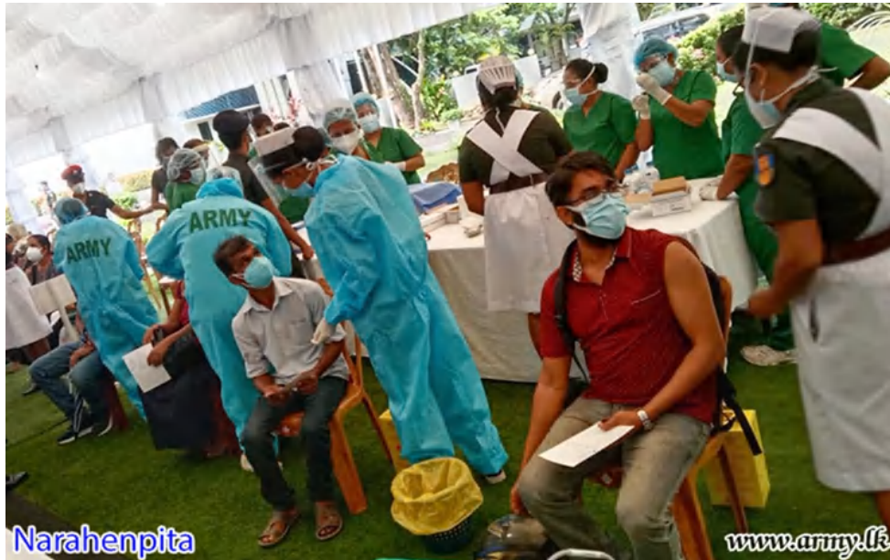
Army-run vaccination centre. Narahenpita Colombo District.

vaccination program, this can be viewed as the execution of a national program by two partners, who are trained on the same processes and use the same guidelines issued by the MoH for COVID vaccination. As such the necessity for segregation of duties, in the form an official agreement, between the Army medical personnel and the MoH personnel involved in the COVID-19 vaccination program does not arise. In this context, it is the MoH that requests the army medical team to conduct vaccination centers at locations decided upon mutually. Community vaccination centers are located in public places away from residential and business areas in order to minimize any disturbances and inconveniences caused to public, where large crowds could be accommodated. These are large open areas with erected temporary shelters with essential utilities.