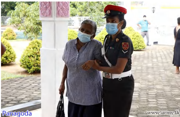
Presence of Military Police at vaccination centre-Panagoda Colombo District.

Brief interviews: A few, 10 randomly selected vaccine recipients ( 6 females and 4 males) from vaccination registers, who got vaccinated at Diyatha Park, Battaramulla and Viharamaha Devi Park were contacted over the phone for their response in relation to the process of vaccination in general, and treatment /behavior of army personnel towards the vaccine recipients. Irrespective of the gender all were satisfied with the treatment they received at the centers. Two persons said that they could not get vaccinated on their first visit due to long queues and heavy rain, in spite of one center being operative 24/7 but got vaccinated in the second attempt. In fact, all of the persons contacted said that they did not feel/observe any difference between the MoH vaccination centers and the Army run centers.