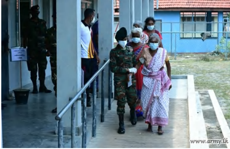
Elderly Lady being helped at a Vaccination Centre in Mannar District.