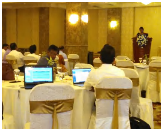
Workshops conducted in Matara and Kandy